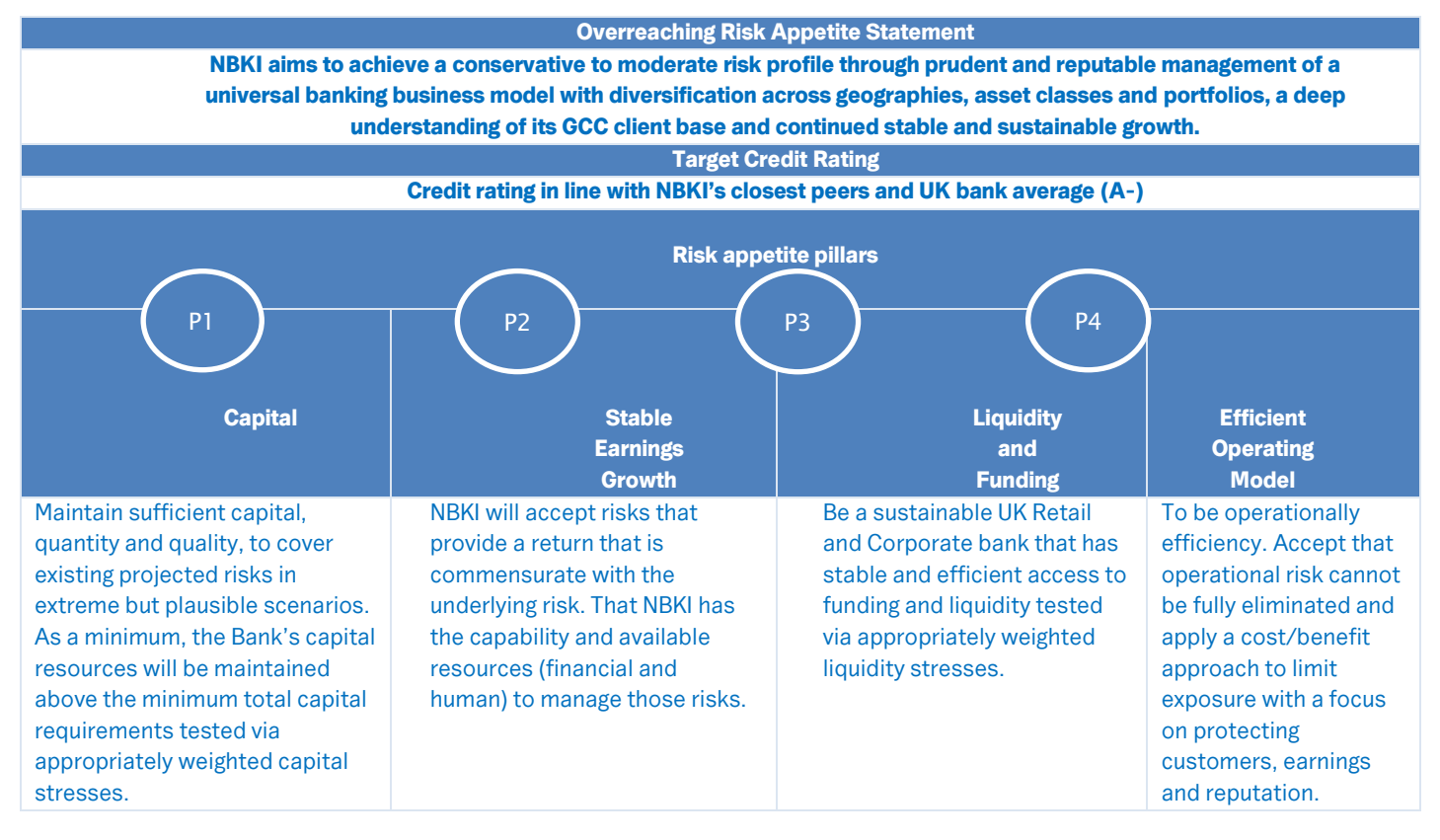
Figure 3: Risk Appetite Statement Pillars

NBKI's RAS document defines a number of quantitative and qualitative measures with a comprehensive tier of appetite and tolerance levels. Ownership of individual RAS metrics is formally delegated to the appropriate NBKI management committee and RAS breaches and escalated quickly to EMC and reported to BRC.