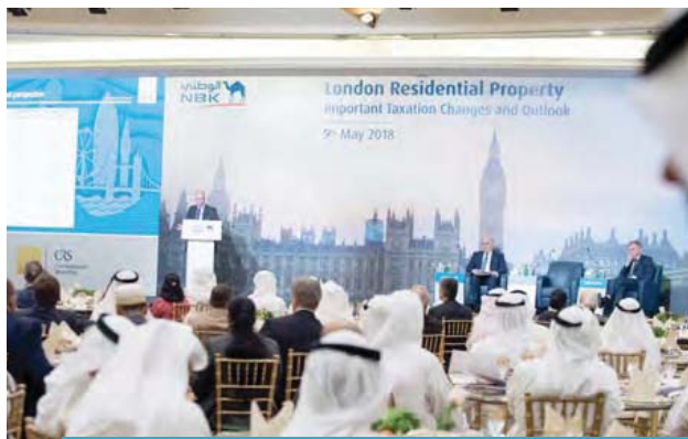
KUWAIT: National Bank of Kuwait holds seminar titled "London Residential Property: Important Taxation Changes and Outlook."

NBK-London Real Estate Services: * Selling and buying of real estate: